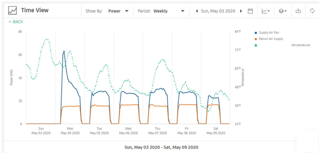
Figure 4: Final post period AHU fan kW

Site Watch Application – After the re-programming, SiteWatch verified the drive was operating as designed. Ongoing measurement in the post-installation period (after the issue was fixed) was used to calculate annual savings for the project and secure utility incentives. The post annual energy use was approximately $20,000 per year, meaning the customer saved almost $40,000 in year one alone! For the life of the project (10 years minimum) savings are expected to exceed $400,000!