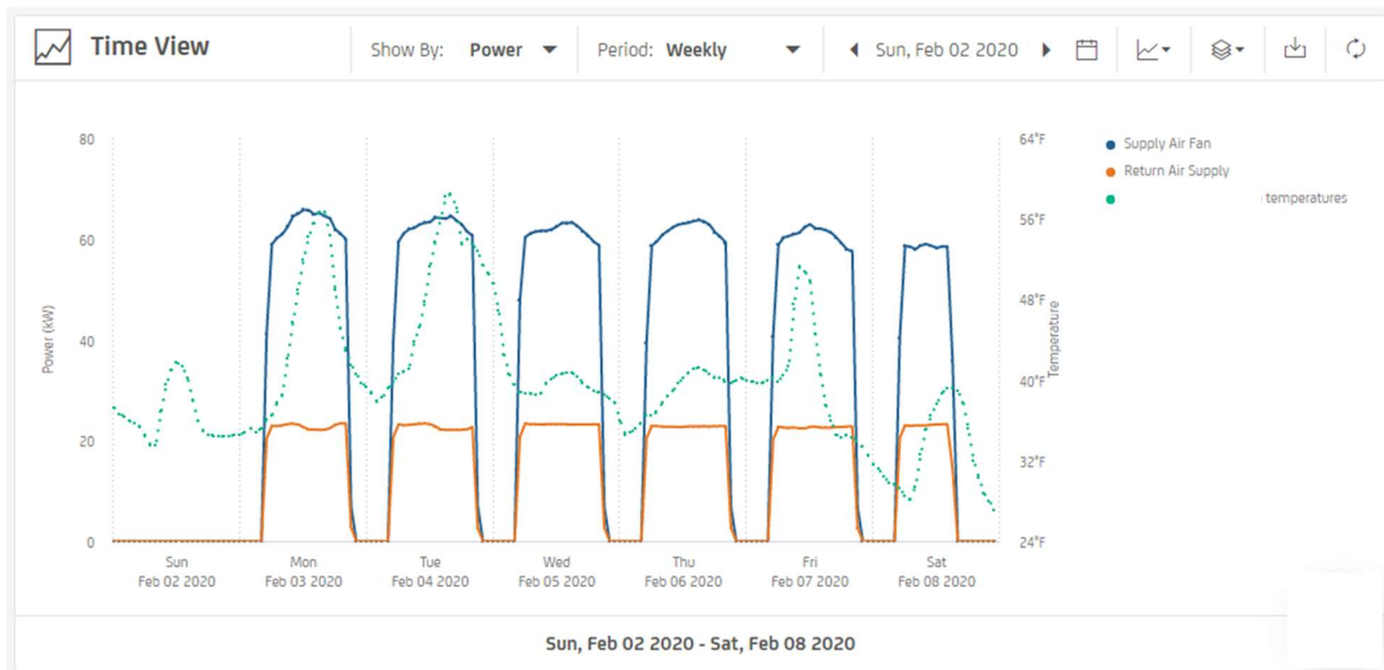
Figure 3: Initial post period AHU fan kW showing fans off overnight and on Sundays, though with higher kW during weekdays and little variation in running kW

Site Watch Application – SiteWatch identified higher-than-expected energy use during weekday periods when the fans were on. Variable speed devices should have allowed motors to unload, reducing kW. In fact, energy use during running periods increased from the baseline.